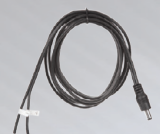
Direct wire kit