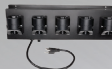
Five bank charger