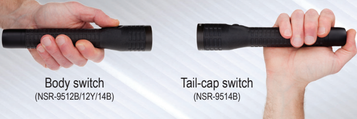
Body switch (NSR-9512B/12Y/14B)