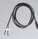
Direct wire kit

*Limited Lifetime Warranty • Product is warranted to be free from defects in workmanship and materials for the lifetime of the original owner. Includes the LEDs, housing, lenses, electronics and switches. Rechargeable batteries and chargers are warranted for a period of one year. Excludes normal wear and abuse.