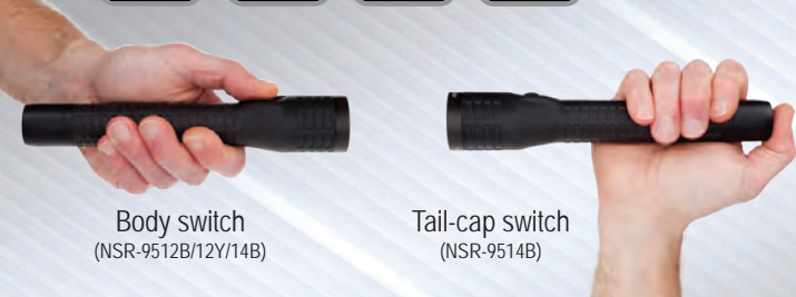
Body switch (NSR-9512B/12Y/14B)