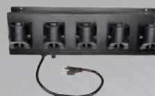
Five bank charger