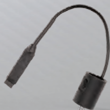
Remote Pressure Switch