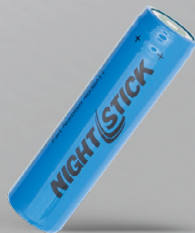
Spare Lithium-ion Battery