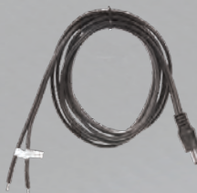
Direct Wire Kit