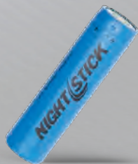
Spare Lithium-ion Battery