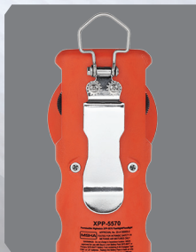
Heavy-duty stainless- steel pocket clip