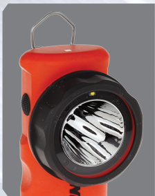
High-efficiency deep parabolic reflector