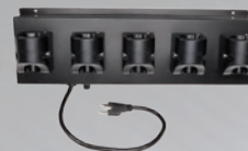
Five bank charger