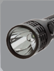
High-efficiency deep parabolic reflector