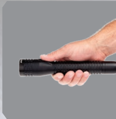
Body switch (NSR-9612B/14B)