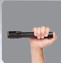
Tail-cap switch (NSR-9614B)