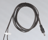
Direct wire kit