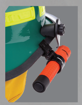
Multi-angle helmet mount