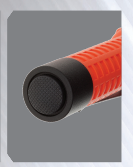
Large textured tail-switch