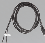
Direct Wire Kit