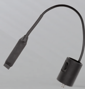
Remote Pressure Switch