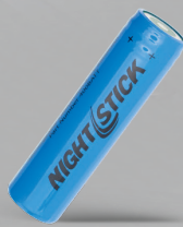
Spare Lithium-ion Battery