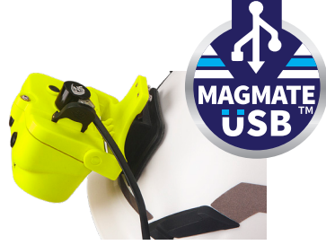
Magnetic Waterproof USB Coupling Never worry about water getting inside your headlamp.